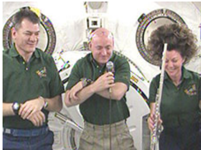
Cady Coleman playing flute in Space!